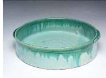
Heather Abt 30 Everett St Portland