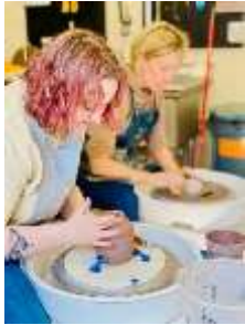
Mill Pond Ceramics 2 Main St, Ste 18-206 Biddeford