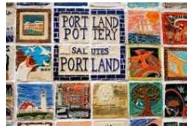
Portland Pottery 118 Washington Ave Portland