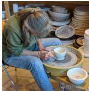
Tall Pines Pottery 356 Brook St Westbrook