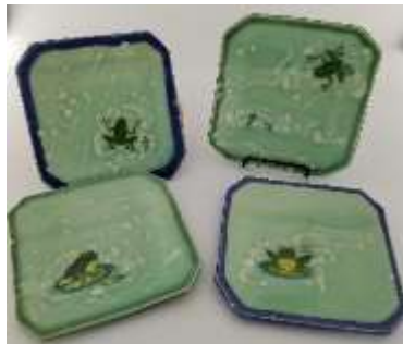
Peeper Pond Studios 18 Mast Rd Scarborough

So much to see on the Maine Pottery Tour!