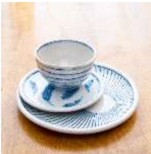
C & M Ceramics 15 Holly St Scarborough