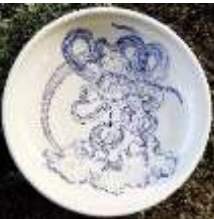
Miki Glasser Ceramics 209 Main St Lincolnville