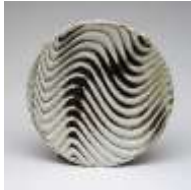
Tyler Gulden Ceramics 45 Clarks Cove Rd Walpole