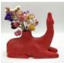
Magick Deery Studio 1147 Peabody Rd, Appleton