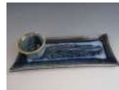
Unity Pond Pottery 222 Bangor Rd Unity