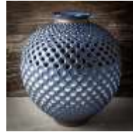
van der Ven Studios 27 Moss Meadow Rd Lincolnville