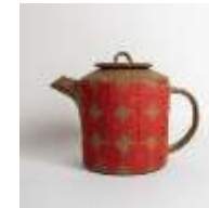
Alice Nasto 2 Bridges Rd Bremen