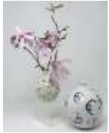
Alexsandra Tomasulo 5 Double Dolphin Way, Walpole