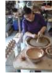
Ash Cove Pottery 75 Ash Cove Rd Harpsswell