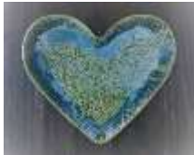
Dragon's Breath Pottery 271 Depot Road, Warren