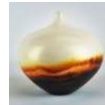
West Third Ceramics 75 Court St Belfast