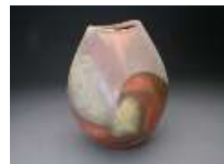
Jody Johnstone Pottery 135 Webster Road Swanville