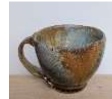
Belfast Clay 34 Front St Belfast