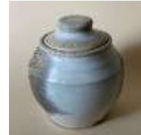
Prescott Hill Pottery 261 Prescott Hill Road Liberty