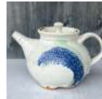
Good Land Pottery 487 Morse Road Montville