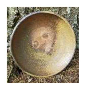
Ellen Sedgwick Pottery 25 Patten Pond Rd, Surry