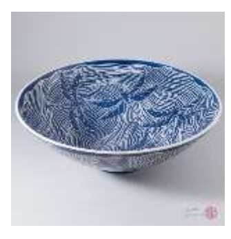
Lansing Wagner Ceramics 12 Long Farm Rd East Blue Hill

Would your business like to sponsor next year's Maine Pottery Tour? For more information contact us at info@mainepotterytour.org