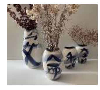
Connie's Clay of Fundy 335 Main St US 1 East Machias