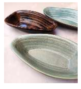
LD Studio 455 Ellsworth Rd Blue Hill