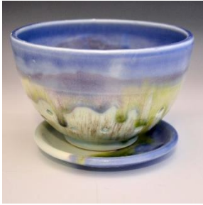
Neighborhood Clay/ Liz Proffetty Ceramics 590 Main St Damariscotta