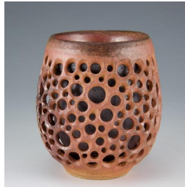
Van der Ven 257 Main St, Lincolnville