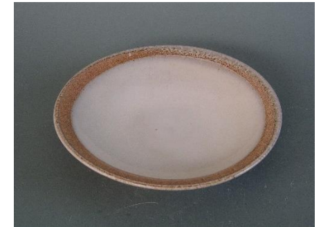
Prescott Hill Pottery 261 Prescott Hill Rd, Liberty