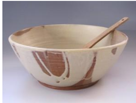
Everyday Pottery 103 Northport Rd, Belmont