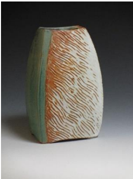
Fireside Pottery 1478 Camden Rd Warren