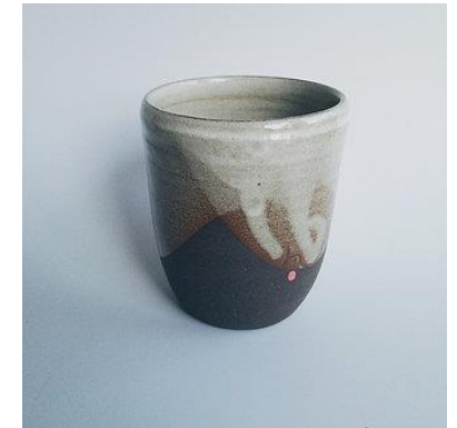
Belfast Clay 132 High St, Belfast