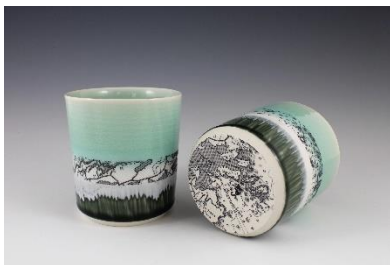
Camden Clay Co 42A East Fork Rd Camden